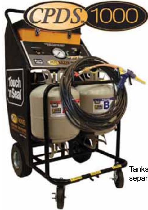
Tanks sold separately.

The Touch 'n Seal CPDS 1000 is an inexpensive, low maintenance dispensing mechanism that, when used according to manufacturer's directions, applies Class I fire retardant, thermal insulating and sound attenuating 2-component polyurethane spray foam.